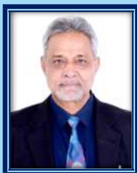
Chairman Organizing Committee